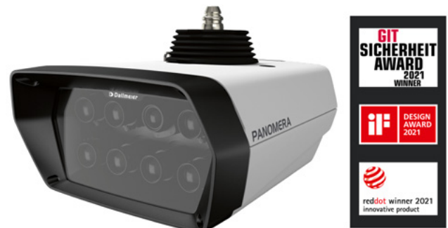
Panomera® multifocal sensor cameras