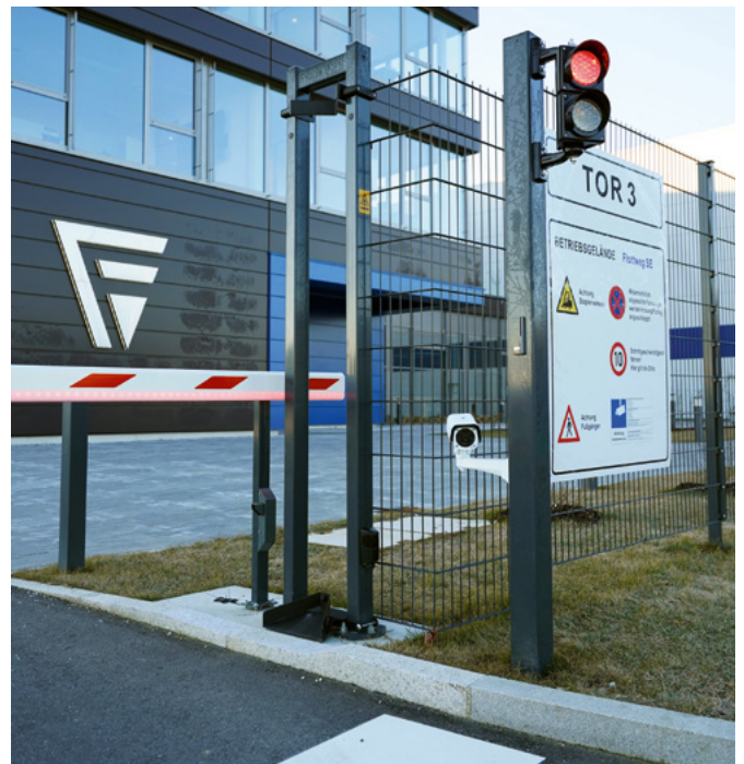
Access management via number plate recognition with Dallmeier box cameras and ANPR solution

For alarm activation and analysis, Flottweg uses the “SeMSy® Compact” Video Management Software (VMS). SeMSy® Compact is the optimum VMS solution for smaller and mid-level requirements, and as an innovative assistance system makes it easy for operators to find sequences