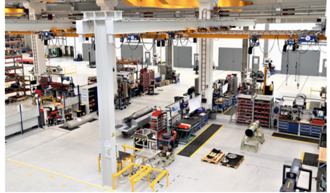
Factory hall and production facility for Flottweg centrifuges

Vilsbiburg, close to Munich in Germany, is the location of the Flottweg SE headquarters and production plant. Here, the separation technology specialist builds plant and machinery for solid-liquid separation on a site covering about 110,000 square metres. In 2021, the company inaugurated its new Factory II, expanding its production area by approximately 18,000 square metres. A decisive element in protecting its business premises of just over six hectares and maintaining its status as Authorized Economic Operator (AEO) is the video surveillance solution supplied by Regensburg-based manufacturer Dallmeier.