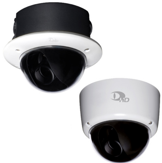
CityWave Austria uses Dallmeier Dome cameras with 4K resolution to capture everything that happens on the platform despite difficult light conditions.

The Dallmeier video system recently delivered proof of its value once again when a hired surfboard was returned to CityWave in a damaged condition after a surfing session. Following a brief investigation, the video recordings showed clearly and unequivocally that the damage was caused during the surfing session. Instead of having to bear costs totalling several hundred euros themselves to repair or replace the surfboard, it was then clear that there could no longer be any discussion about the cause.