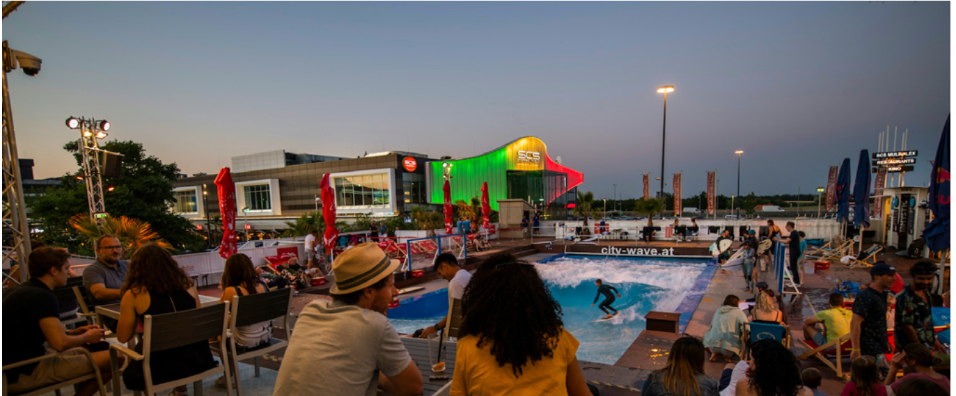
Unobtrusive video security “Made in Germany”: A Dallmeier dome camera (top left in the picture) captures the activity on the CityWave platform.