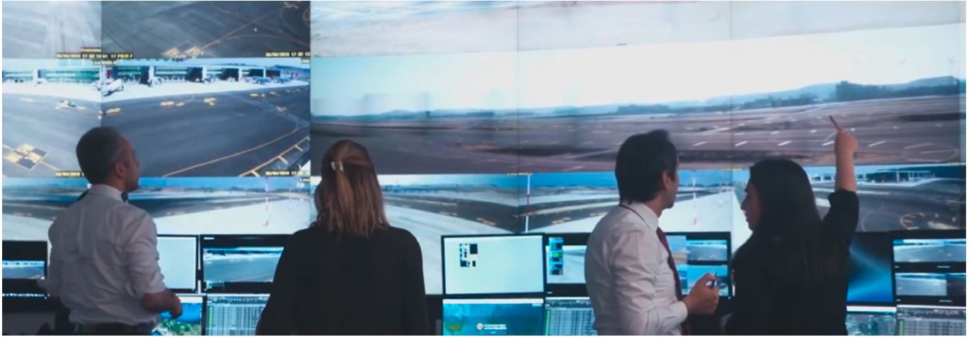
The “Virtual Tower” concept allows aircraft movements on the IGA to be tracked remotely.